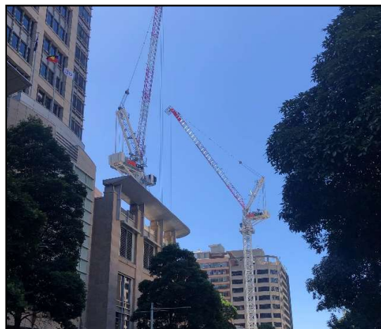
Tower cranes along Park Street for the delivery and removal of equipment and material in to and out of the sites